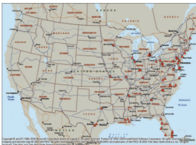
▲ FMS Facilities with INHD Programs in 2007

The study cohort included 655 patients who were treated by INHD for an average of 55 \pm 73 d as of January 1, 2007, along with 15,334 control subjects who were treated by CHD, with