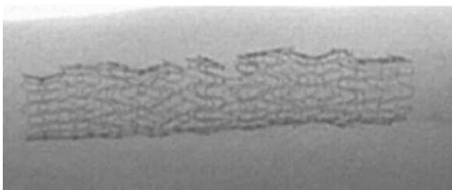
Figure 3. Stent damage due to repeated cannulation for dialysis. From reference # 65 with permission.

Dialysis staff responsible for cannulating the access through the stent might require a specific order by the nephrologist. In this context, it is prudent for the interventionalist to communicate with the renal physician regarding the stented area and cannulation guidance. Dialysis staff should then be made aware of the stent and given specific instructions regarding cannulation to minimize infection and avoid injury. As an aside, patient education regarding the position of the stent might be important for the following reason. It is conceivable that for an access procedure, the patient might end up in a center that did not perform the original stent. In this context, the new interventionalist might find himself/herself cannulating the stented area and encountering problems. Patient education regarding vascular access is then critical. The above-cited issues gain more importance as these devices are not approved for this purpose. It is important to note that the use of covered stents in the treatment of pseudoaneurysm presents an “off label” use of these devices. While critically important, medico-legal ramifications of cannulation through a stent are unknown.