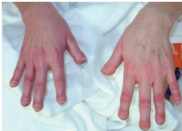
Figure 2. Sclerodactyly and severe clubbing seen in the patient with NSF.

in the study by Marckmann et al. (5), as well as with our patient (Table 2).