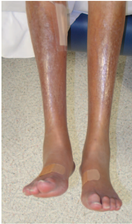
Figure 1. Shiny, discolored, woody skin (on inspection and palpation) seen in the patient with nephrogenic systemic fibrosis (NSF). This picture was taken approximately 1 to 1.5 mo after the initiation of sodium thiosulfate (STS) therapy.